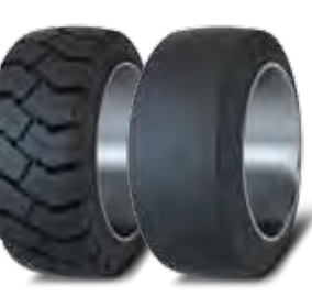
Magnum Magnum SM